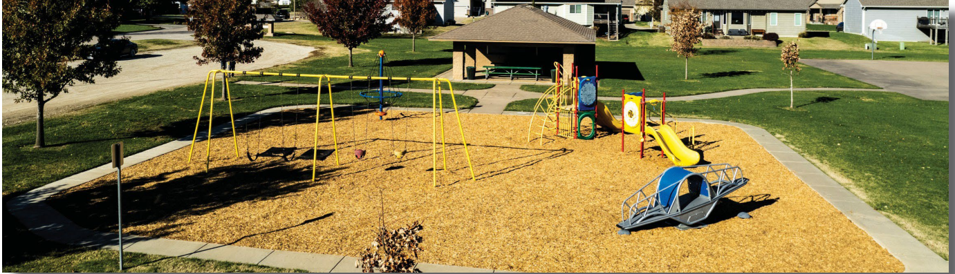
Kirby Park and Shelter