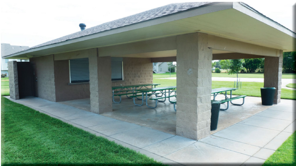
Kirby Park Shelter